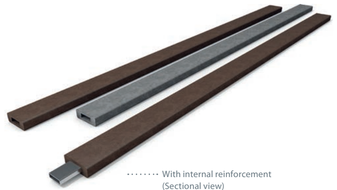
..... With internal reinforcement (Sectional view)

Temperature-dependent length fluctuation (up to +/- 1,5 %) can appear, please inquire about the maximum span.