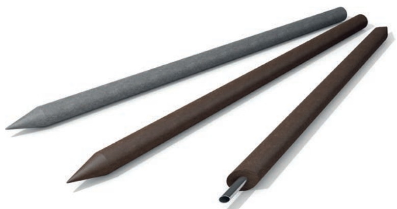
■ Grey ■ Brown